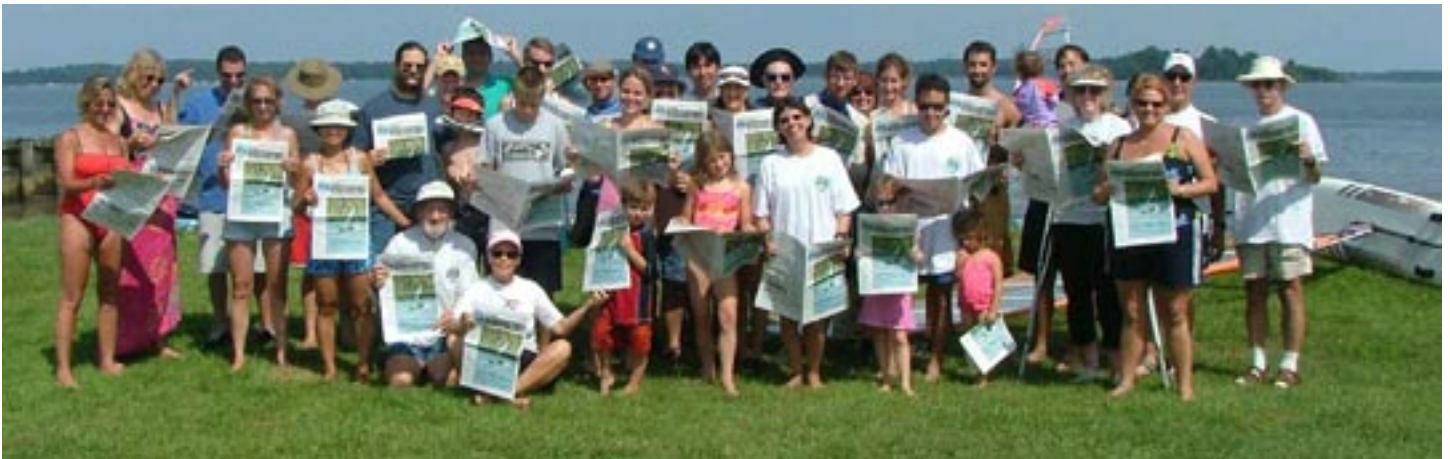
Our NEWJ picture