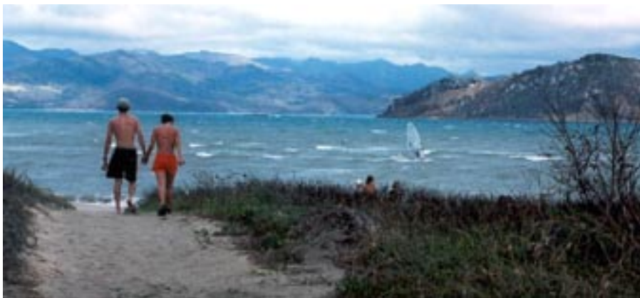
Eco Playa Resort at Bahia Salinas