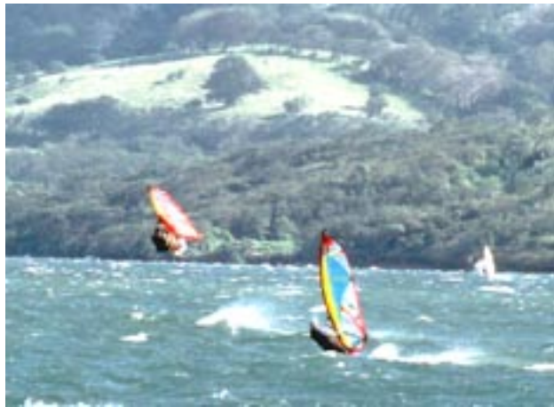
Locals ripping it up.

On the third day we ventured North 2.5 hours to check out a new sailing site on the Bahia Salinas, a bay along the Pacific coast just south of the Nicaraguan border. We spent two days at the Eco Playa resort.