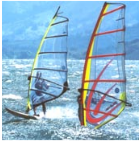
Powered up on 3.3's

The first few days were actually cold and rainy. The locals said it was the coldest weather they could remember, with temps in the 60's during the daytime. The same weather system that brought 20-degree lows to Florida was also influencing the weather in Central America. The deep low-pressure system also brought