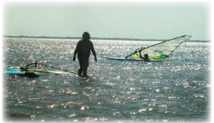
Bird Island Basin