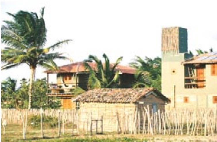
Vila Bela Vista

See Jan/Feb 2003 BABA newsletter for more information on Jericoacoara - available at www.windsurfbaba.org