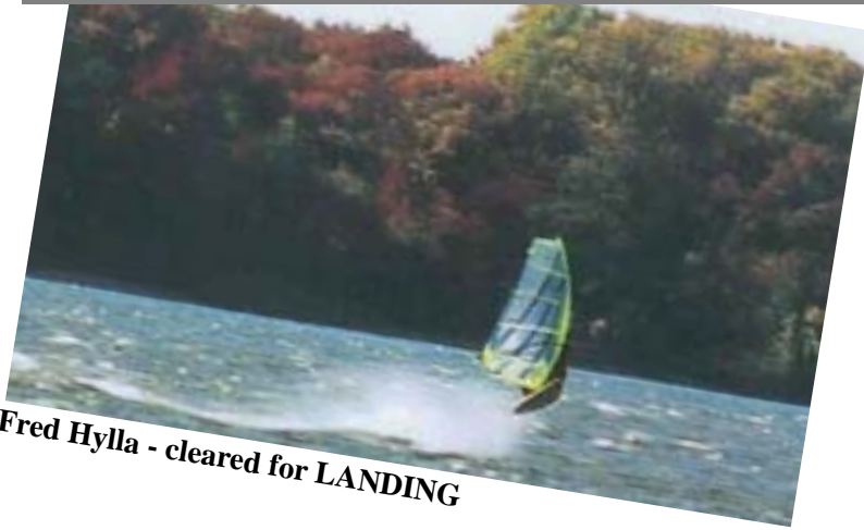
Fred Hylla - cleared for LANDING