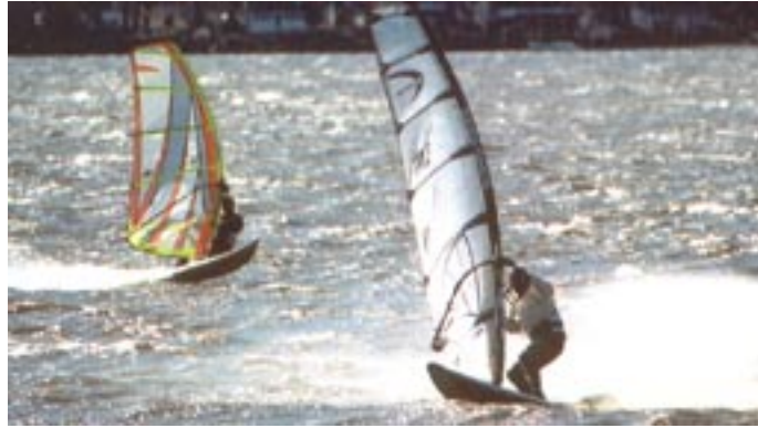
Fred Hylla (l) and Mark Weinman (r) at Rocky Point

If the winds are NW check out Rocky Point Park (golf course side). Rocky Point offers side shore winds, with parking and grass rigging area close to the water. Kentmoor Marina on Kent Island is another good launch for NW winds. Launching from Kent Island provides challenging open water sailing with large swell and ramps for bump and jump. For the occasional NE wind, Sandy Point State Park is hard to beat. For SW try North Point Park in Edgemere. North Point offers a sand beach launch, flat water on the inside and