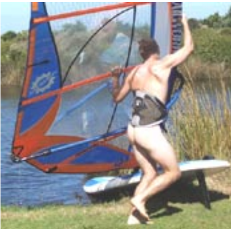
The Naked Windsurfer prepares to launch.