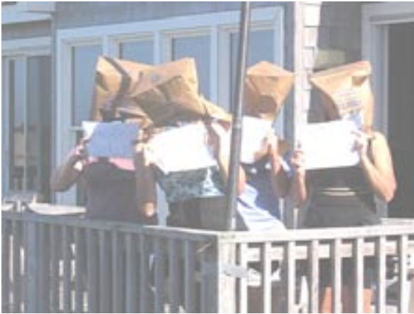
The BABA Women's demand for "More Naked" was posted on YouTube.... http://www.youtube.com/watch?v=hPTbtKnlxHc